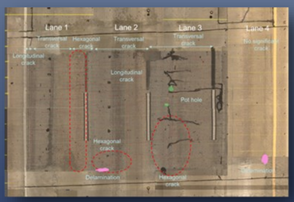
Overall condition of the deck at downtown

NEXCO's inspection pinpointed major and minor spalls, delamination, unsound patches, pattern cracking, and moderate to severe cracks. Significant time savings over chain dragging inspections were noted.